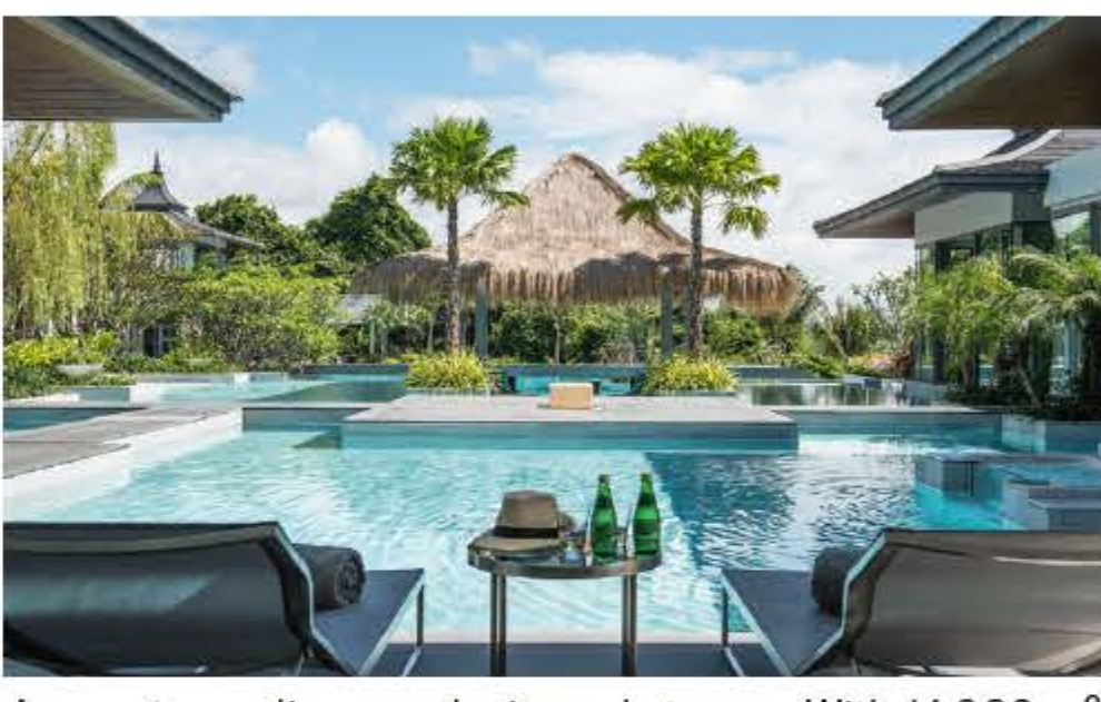
A secret paradise – exclusive only to you. With 14,000 m<sup>2</sup> of tropical property that can accommodate more than 16 guests, The Resort Villa is a secret paradise dedicated to one group of guests at one time, offering sustainable luxury at its best in complete privacy. Visit theresortvilla.com IG: @theresortvilla