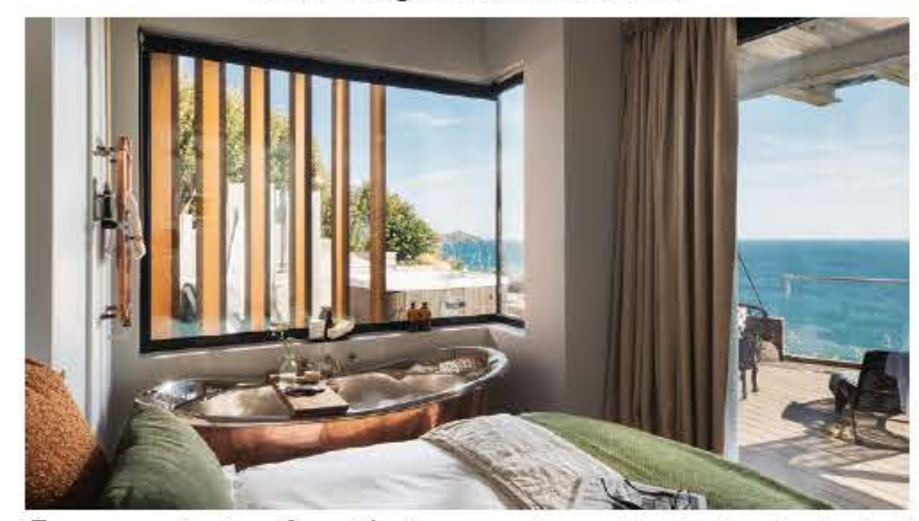
From cosying up fireside in a country cottage, to stargazing from a dreamy hot tub at your clifftop hideaway, seek the magic of a staycation with Boutique Retreats. Uncover their curated collection of luxury retreats, set in unique locations across the UK. "We know how good getaways should be". Visit boutique-retreats.co.uk and follow on IG: @boutiqueretreats